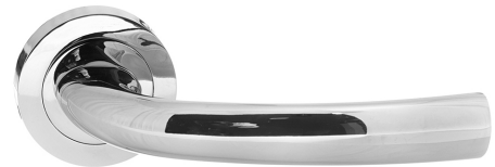
Product Finish Pictured: Polished Chrome